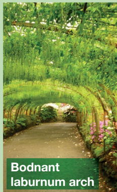
Bodnant laburnum arch